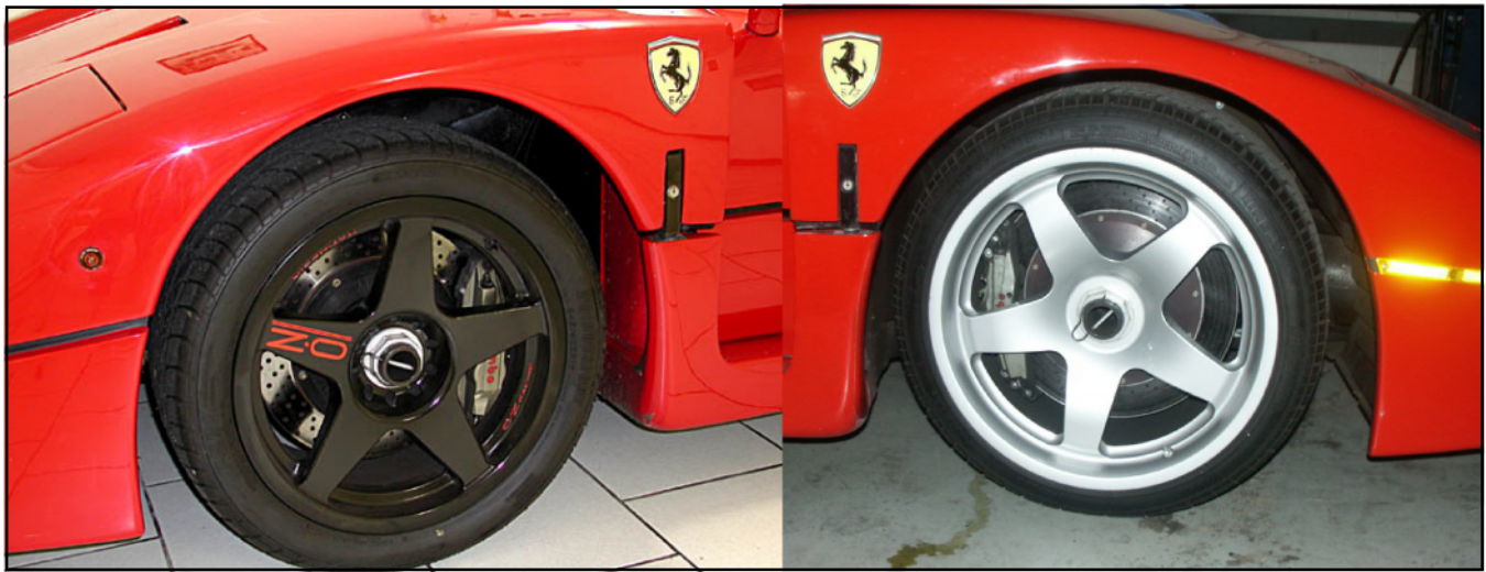
F40 Brembo GT brake kit with 18" wheels

Note: all kits come with caliper brackets, hardware, and brake lines. Caliper colors include black, red, silver and yellow. Ferrari logos available at extra cost.